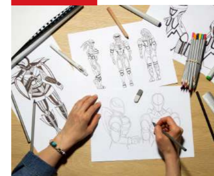
ANIMATION & GAMING DESIGN