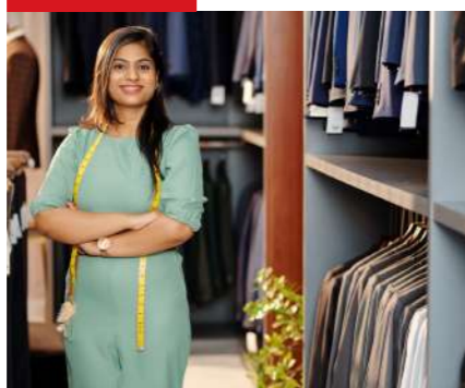
FASHION DESIGN & STYLING

We offer comprehensive 11 month certificate programmes (Certified by Pearsons) designed to elevate the skills and competencies of our participants. This meticulously crafted curriculum combines the advantages of offline courses, ensuring a holistic learning experience. We aim to pioneer a novel educational approach, equipping learners with innovative and disruptive professional skills. This forward-thinking programmes are tailored to empower students to tackle both corporate and societal challenges with unwavering confidence and clear conviction.