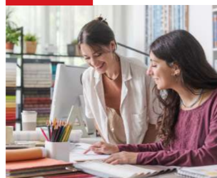
INTERIOR & SPACE DESIGN