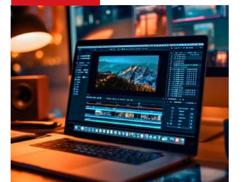
FILM MAKING & EDITING