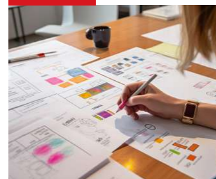
VISUAL COMMUNICATION & INTERACTION DESIGN